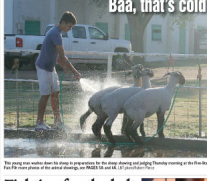
Baa, that's cold

Fighting for the belt NEW YORK (AP) — The 17-year-old daughter of a New York City police officer is fighting for the title of "Miss America" in a competition that she says is "a lot of pressure." She is competing against other girls from across the country for the title of "Miss America 2014." She is currently in the top 10 and is competing for the title of "Miss America 2014."