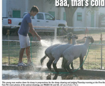
Baa, that's cold