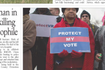
The 10th of the state's voters are protesting the proposed changes to the state's voting system. The protesters are holding signs that say 'PROTECT MY VOTE'. The proposed changes would allow voters to cast their ballots by mail. The changes are being opposed by many voters who are concerned about the security of the system.