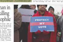
A group of people is gathered at a political rally. A woman in the foreground is holding a blue sign that says 'PROTECT MY VOTE'. Other people are visible in the background.

A 28-year-old woman from Colorado is in custody after she is suspected of killing a man who was suspected of being a pedophile. The incident occurred in a public area.