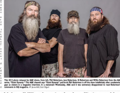
The Robertson brothers, from left, Phil, Willie, Korie and Si Robertson, are the main characters on the reality TV show "Duck Dynasty." Robertson was removed from the show after making homophobic comments on the show's website.