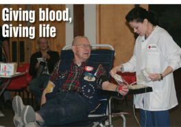
Giving blood, Giving life Page 10A

The City of Liberal (population 10,000) and the Liberal School District (population 10,000) are in the process of approving a sales tax agreement. The agreement gives the city and school district a 1.5 percent sales tax for five years. The agreement will be approved by the city council and school board on April 6, 2014. The agreement will provide an additional $1.5 million in revenue for the school district and $1.5 million for the city. The agreement will also provide for the city to provide certain services to the school district, including maintenance and security. The agreement will be a significant step in the relationship between the city and school district.