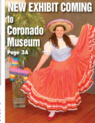
NEW EXHIBIT COMING to Coronado Museum Page 3A