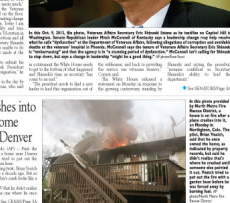
Senators call for VA secretary's resignation

Senators call for VA secretary's resignation Senators on Tuesday called for the resignation of the U.S. Department of Veterans Affairs secretary, Robert Wilkie, after he was accused of covering up the deaths of two veterans. The senators said that Wilkie had failed to disclose the deaths of two veterans who had died while in the service of the United States. The senators said that Wilkie had failed to disclose the deaths of two veterans who had died while in the service of the United States.